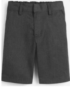
Boys Grey Short trousers