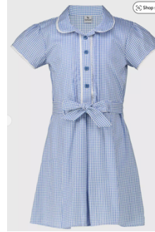
Girls Blue Gingham summer dress